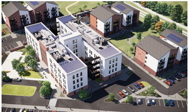
Chiltern Vale Residential Dunstable