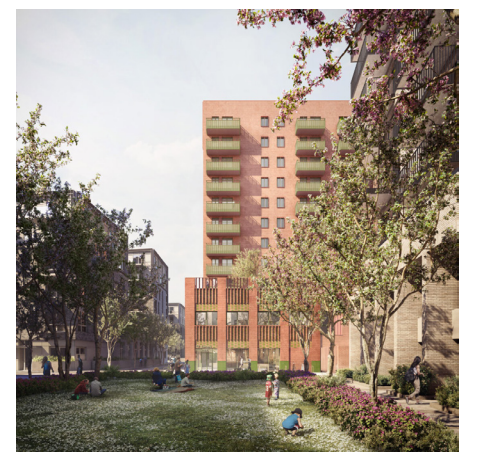
South Grove, Walthamstow

We've been trading for over 35 years. We specialise in large scale new build developments. We predominantly work across London, Peterborough and the South East, and specialise in setting up on-site management teams to ensure our work is of the highest quality.