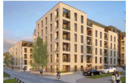
Millbrook Park, Mill Hill