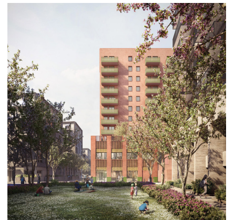
South Grove, Walthamstow

We've been trading for over 35 years. We specialise in large scale new build developments. We predominantly work across London, Peterborough and the South East, and specialise in setting up on-site management teams to ensure our work is of the highest quality.