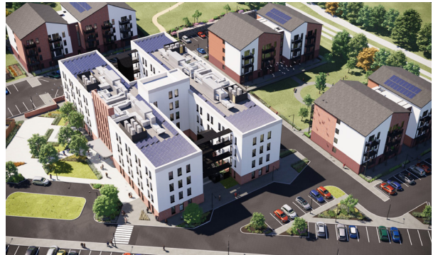
Chiltern Vale Residential Dunstable