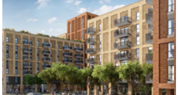
Kew Bridge Office