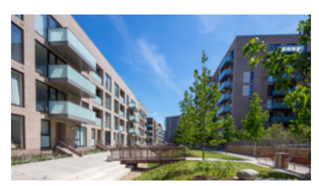
Aberfeldy New Village